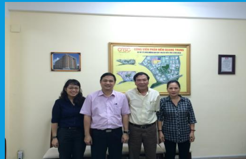
Visiting Quang Trung Software Park, Jun. 2016