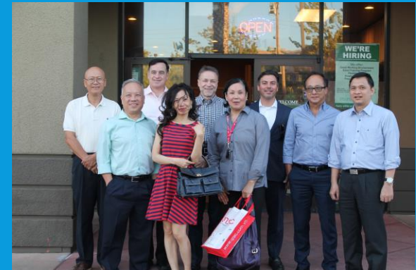
Networking with IT Executives in March and July, 2016 San Jose, CA