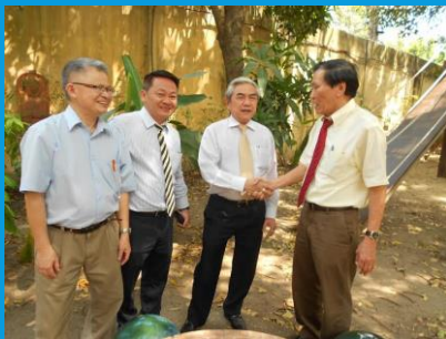
Meeting Minister of Science & Technology HCMC, Feb. 2016